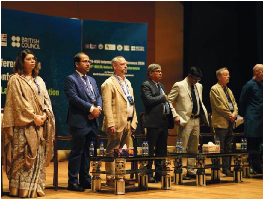
The Department of English and Modern Languages in collaboration with Bangladesh English Language Teachers Association organized the two-day long 11th BELTA-NSU International Conference titled “Re/Envisioning Paradigms in English Language Education”