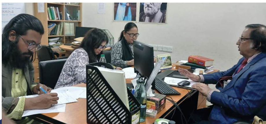
Cumilla Project team members from DHP engaged in brainstorming to develop their CTRG granted project