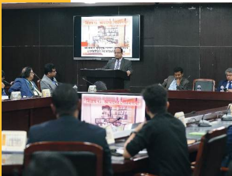
Department of History & Philosophy launched The Liberation War Research Center (LRC) and organized a seminar on “Victory '71: Our Glorious Story”