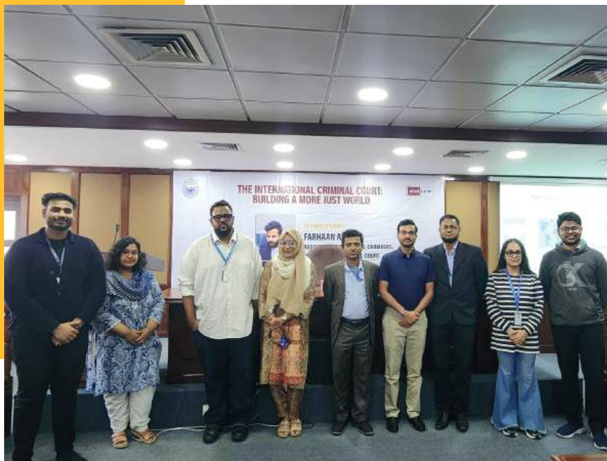
A lecture titled “The International Criminal Court: Building a More Just World” was organised by the Department of Law, North South University, on 24 December 2024